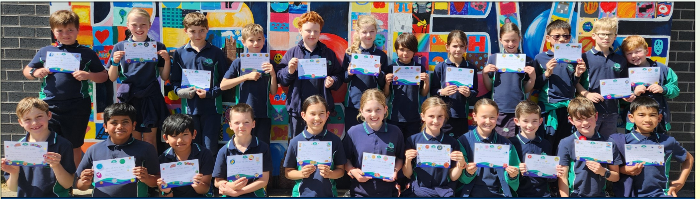
Years 3 & 4