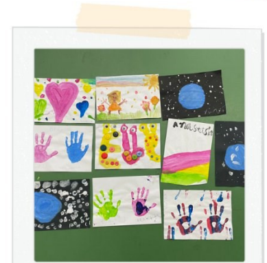
Artworks showing individual expression

Please ensure you let our service know if your child is unable to attend any sessions by contacting us at 0439 161 164. Your proactive communication will assist us in improving our service to you, and we appreciate your cooperation in keeping us up to date.