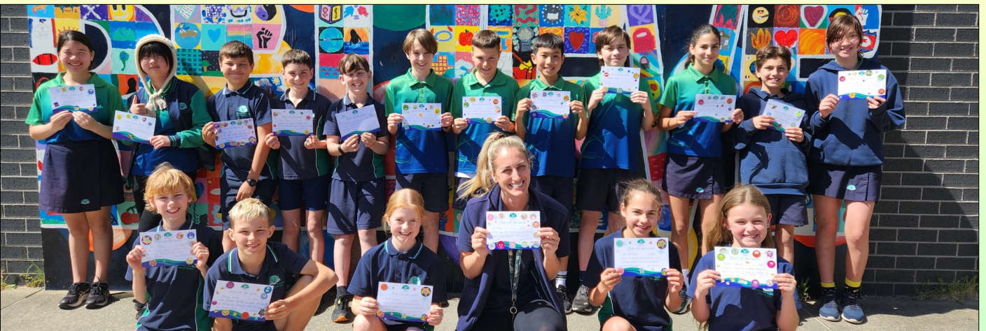
Years 5 & 6